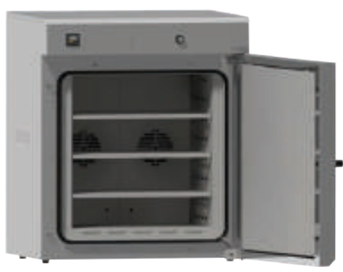
SNOL 120/300 NL